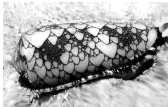
Figure 1: A Cone Shell Bearing a Gnarly Cellular Automata Pattern

I'll say more about gnarly computations in the next section, but for now suffice it to say they are complex and unpredictable. In my book's title, I use the word "seashell" to represent the notion of gnarly computations because certain seashell patterns are believed to be naturally occurring computations of this complex sort. (See Figure 1.)